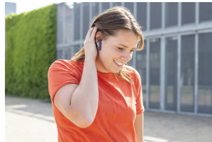
LIFESTYLE VISUAL 1