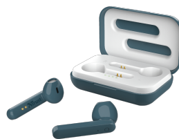
PRODUCT VISUAL 2