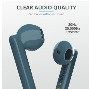
PRODUCT PICTORIAL 4