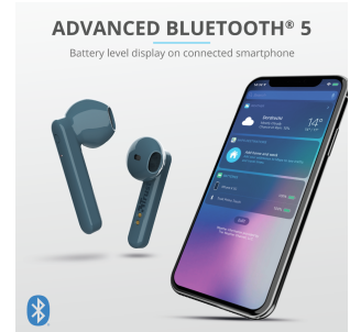
PRODUCT PICTORIAL 5