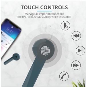
PRODUCT PICTORIAL 3