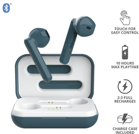
PRODUCT ESHOT 1