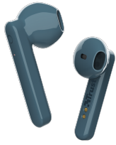
PRODUCT VISUAL 1