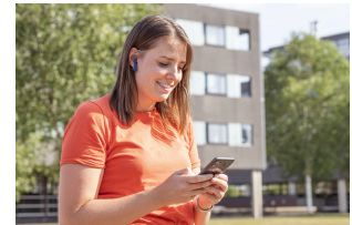
LIFESTYLE VISUAL 2