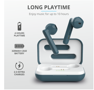
PRODUCT PICTORIAL 2