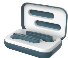
PRODUCT VISUAL 3