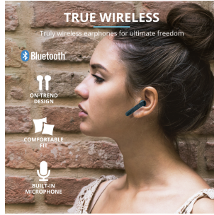
PRODUCT PICTORIAL 1