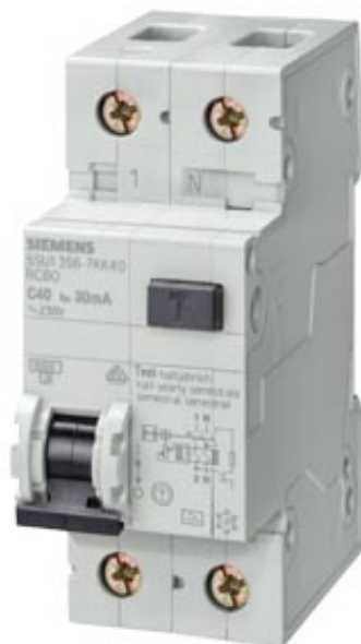
FI/LS-PROTECTOR TYPE A (PSE/SSF), D=70MM IFN 30MA,6KA, 1+N-POLEE B 10A