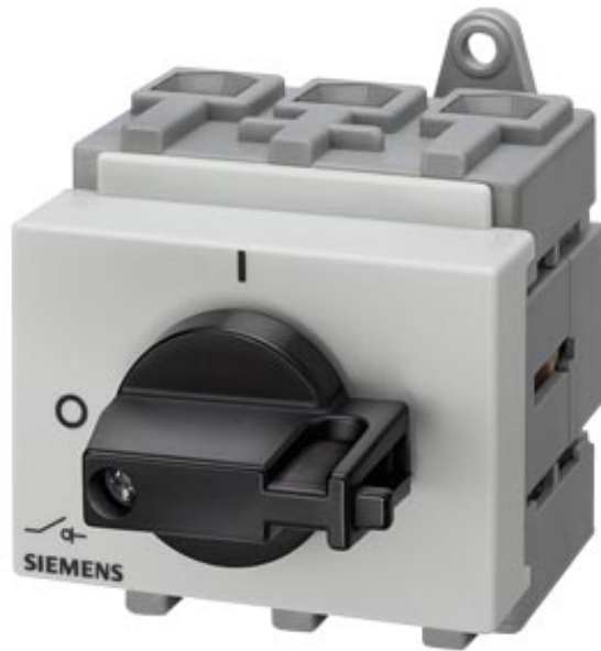
MAIN CONTROL SWITCH 3-POLE IU=100, P/AC-23A AT 400V=37KW BASE MOUNTING MOUNTING RAIL/TWO-HOLE MOUNTING KNOB BLACK