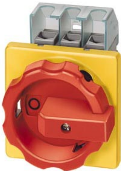
4-P. MAIN CTR. SWITCH IU=16, P/AC-23A AT 400V=7.5KW FRONT MOUNTING 4-HOLE MOUNTING ROTARY ACTUATOR BLACK