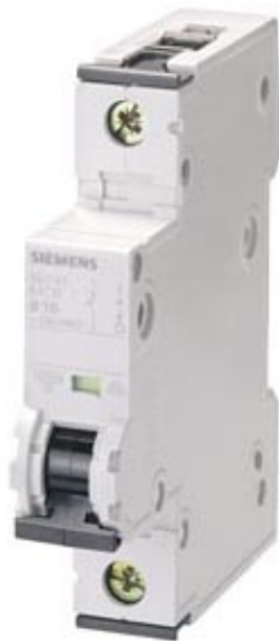
CIRCUIT BREAKER 230/400V 6KA, 1-POLE, C, 1A, D=70MM