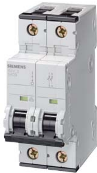
CIRCUIT BREAKER 230V 10KA, 1+N-POLE, C, 2A, D=70MM