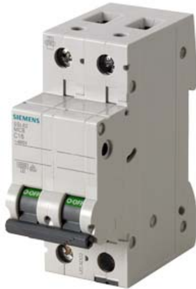
CIRCUIT BREAKER 230V 6KA, 1+N-POLE, C, 16A