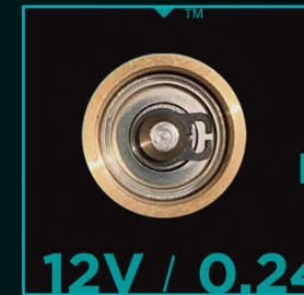
Rigid Brass Housing