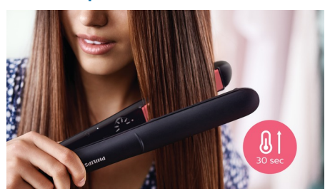
The straightener has a fast heat-up time, being ready to use in 30 seconds.