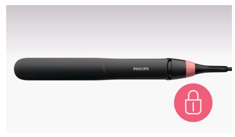
The plates can be locked together for safe and easy storage.