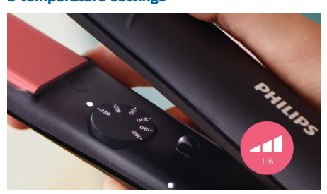
Variable temperature settings for better control. Lower temperatures for last-minute touch-ups and gentle styling. Higher temperatures for long-lasting results.