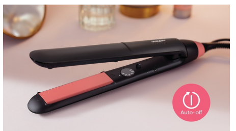
The styler has an automatic shut-off function for safe usage. It automatically switches off after 60 minutes.