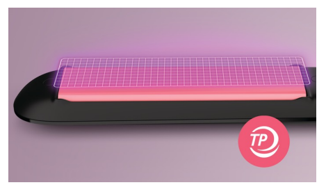
ThermoProtect technology distributes heat evenly across the plates, preventing overheating to protect your hair.