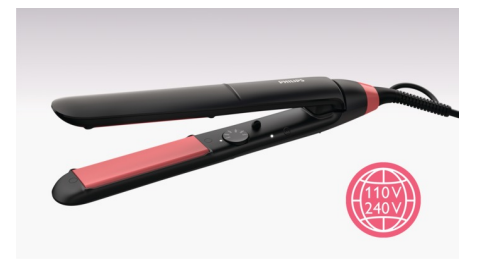
Compatible with 110-240 volts. Can be used wherever you travel in the world.