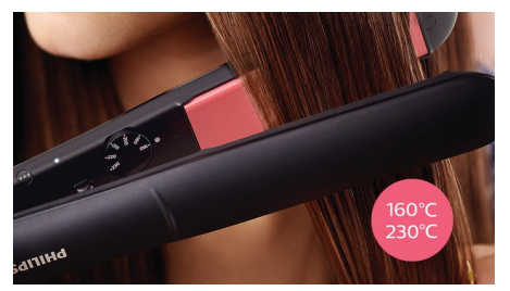
Choose from a temperature range from 160°C up to 230°C to secure long-lasting results while minimising the risk of hair damage.